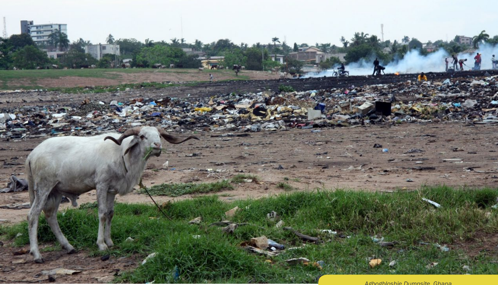
Agbogbloshie Dumpsite, Ghana

then examined the burden that toxic pollutants can put on population health in the context of the contaminated sites that are the focus of Green Cross Switzerland and Blacksmith's work. The identification and investigation of polluted sites is an ongoing task, increasingly being picked up and shared by local agencies in the countries involved. Therefore discussion of geographic regions in this report is by no means complete since it only represents sites that have been identified and are under investigation to date.