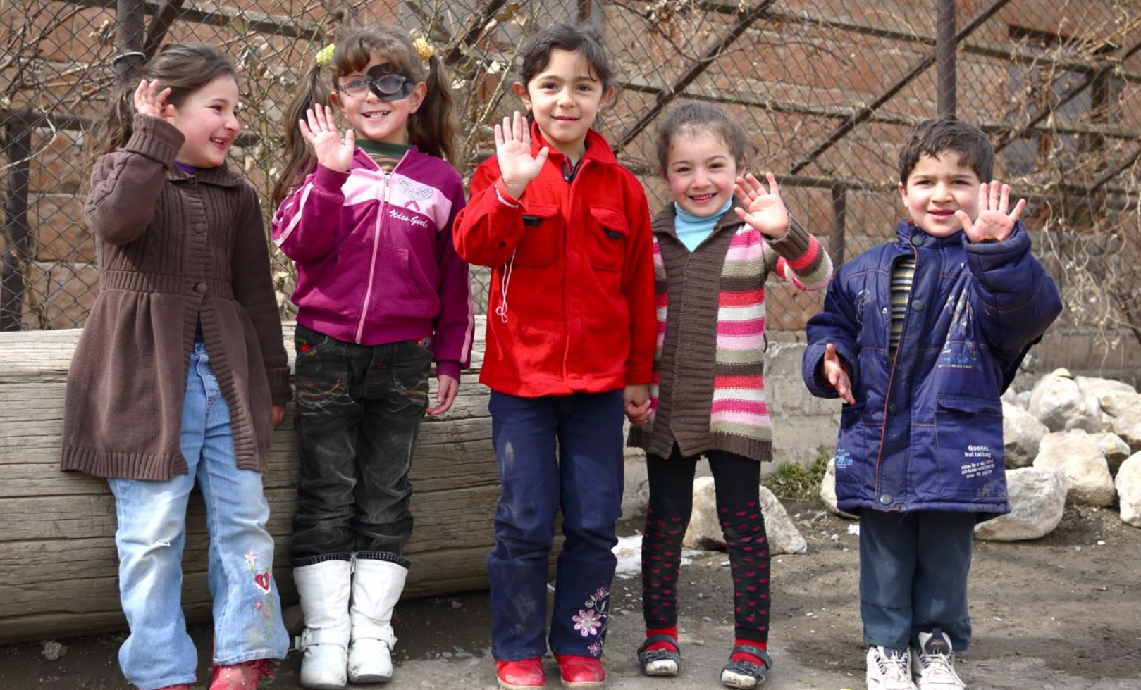
Progress has been made at Rudnaya Pristan, but more action is required

progress in dealing with pollution issues on a national level (see A Special Note on India below). The authors are hopeful that Sukinda will be addressed as part of these new programs.