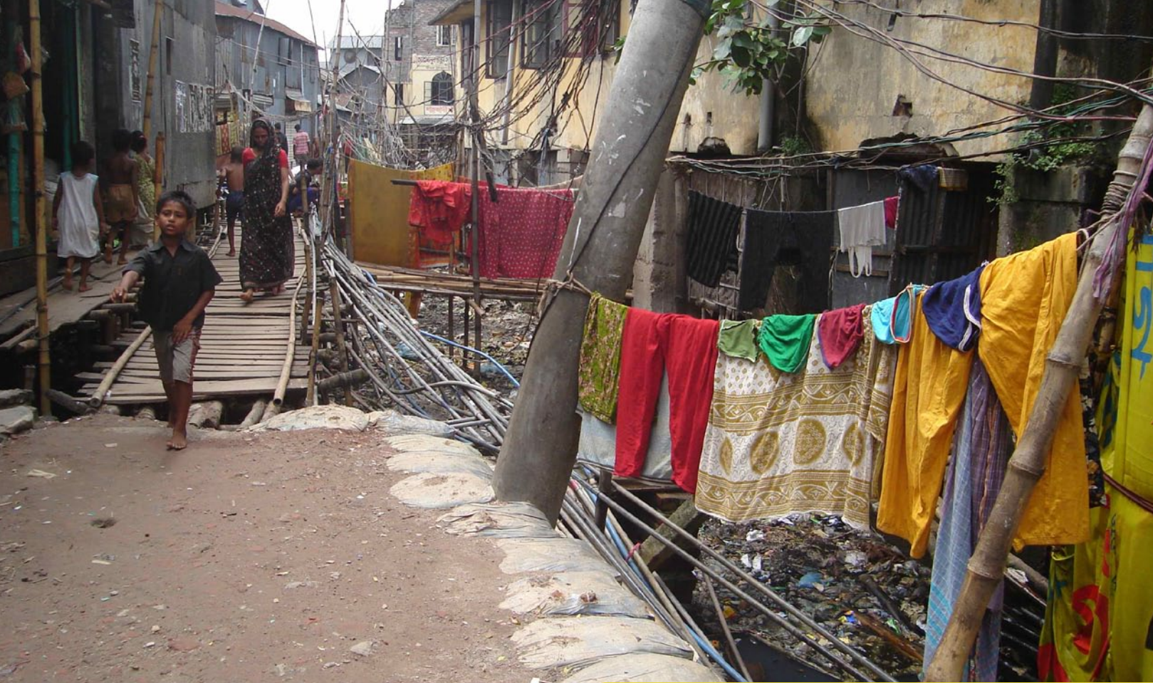
Hazaribagh is heavily contaminated with Hexavalent Chromium

A conservative estimate of the population at risk might fall in the area of 40,000 people. 5 However, a more in-depth assessment would be required to better capture the risk, which might affect as many as 250,000 people. Since 2008, Blacksmith Institute and its partner, Green Advocacy Ghana (GreenAd), have been piloting technologies to aid recyclers in replacing the burning process. Hand wire-stripping tools introduced in 2010 were met with a small-degree of success but burning remained the preferred method. Currently, project partners are working to mechanize the wire-stripping process through the creation of work stations outfitted with a variety of wire-stripping machines. These machines eliminate air pollution and centralize recycling to reduce wide-spread communal exposures. Comprehensive health and occupational safety trainings, implemented since 2008, have built the