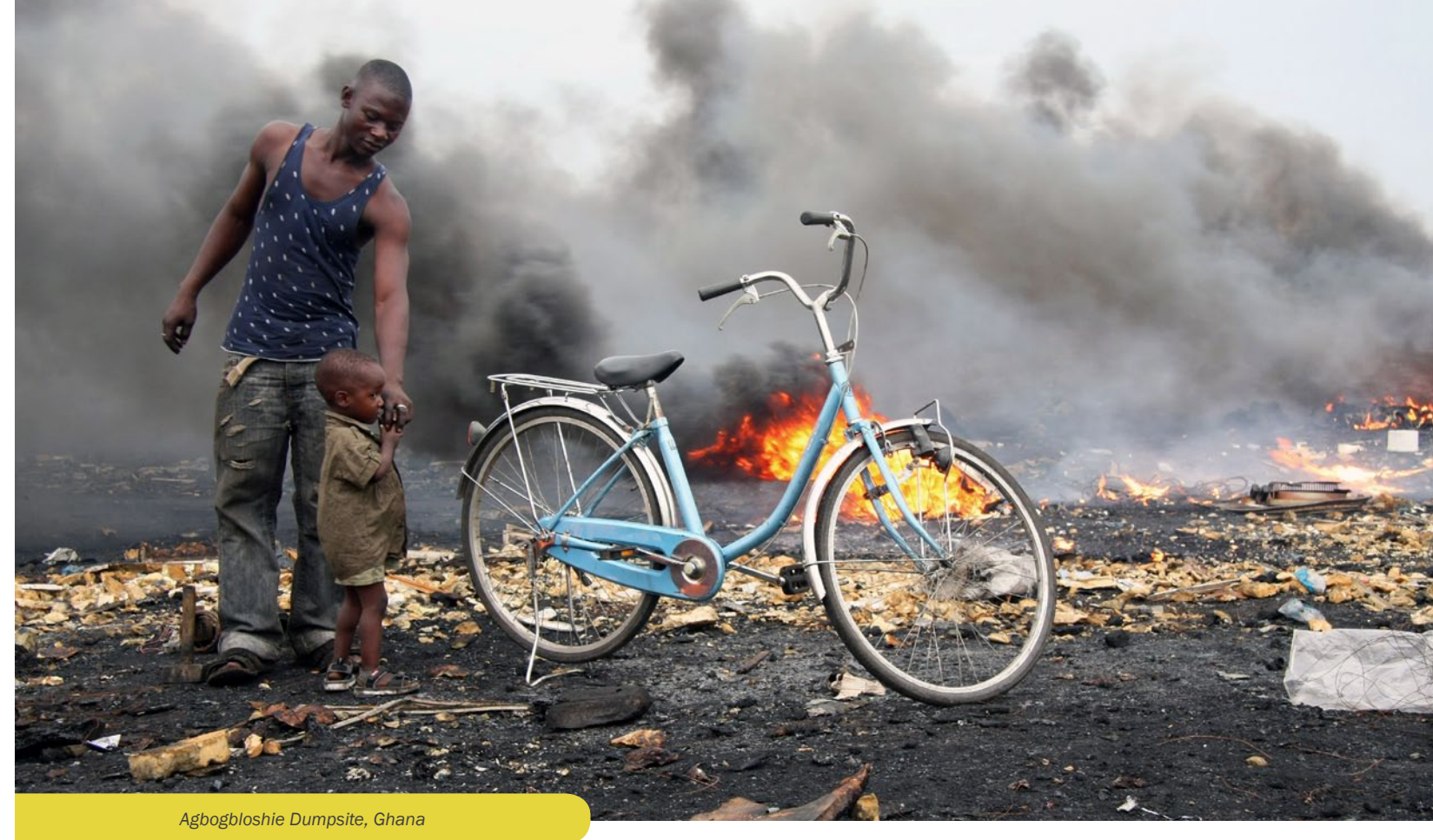
Agbogbloshie Dumpsite, Ghana

2020. Approximately half of these imports can be immediately utilized, or reconditioned and sold. 2 The remainder of the material is recycled, and valuable parts are salvaged.