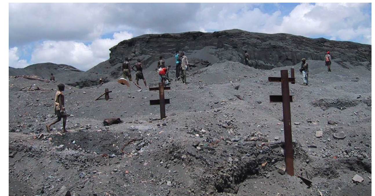
Tailings in Kabwe continue to be mined artisanally