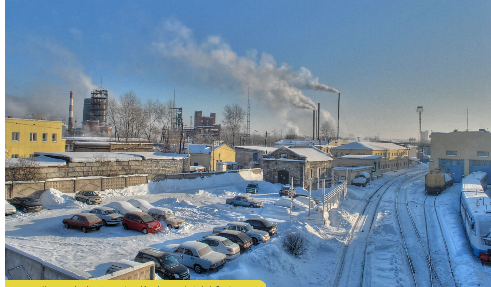
Numerous air pollutants are released from large smokestacks in Russia

were still employed in factories that produce toxic chemicals at the time our 2007 report was published. In 2003, the death rate was reported to exceed the birth rate by 260%, and the city's annual death rate (17 per 1,000) is higher than Russia's national average (14 per 1,000). In a city of 300,000, that translates to about 900 extra deaths annually. The average life expectancy is reported to be 42 years for men and 47 for women. 74