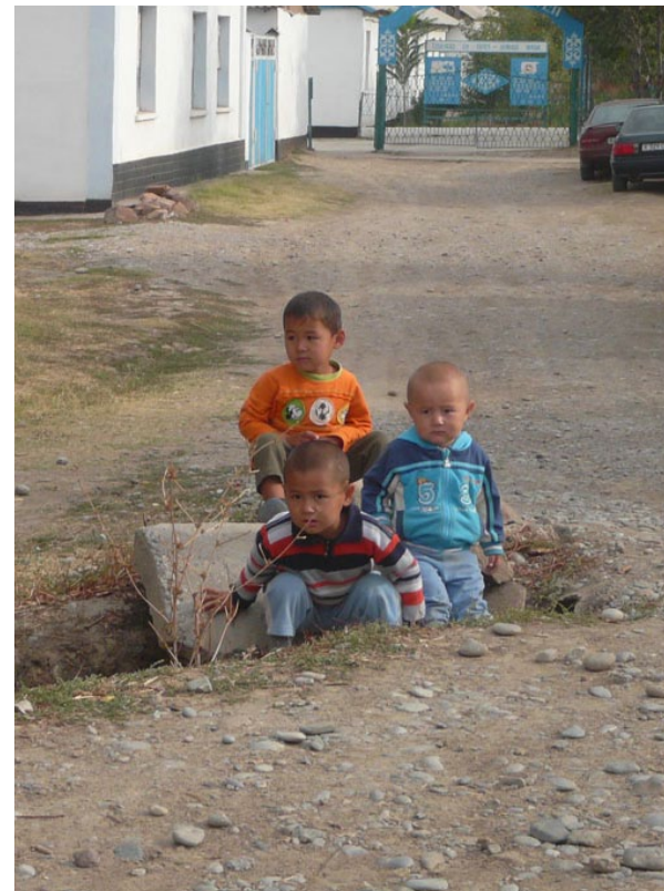
Children playing near in lead contaminated soil

contains 97% of India's chromite ore deposits and one of the largest open cast chromite ore mines in the world. In 2007, twelve mines operated with inadequate environmental management plans, resulting in considerable pollution in the area. Perhaps as much as 30 million tons of waste rock were spread over the surrounding areas. 54