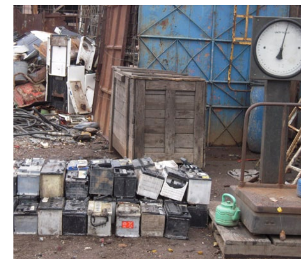
Informal used lead acid battery processing is one of the world's worst pollution problems

Current efforts include specific projects and related activities to deal with priority issues and sites, as well as technical and financial support to build the capacity of communities, governments, and industry groups to