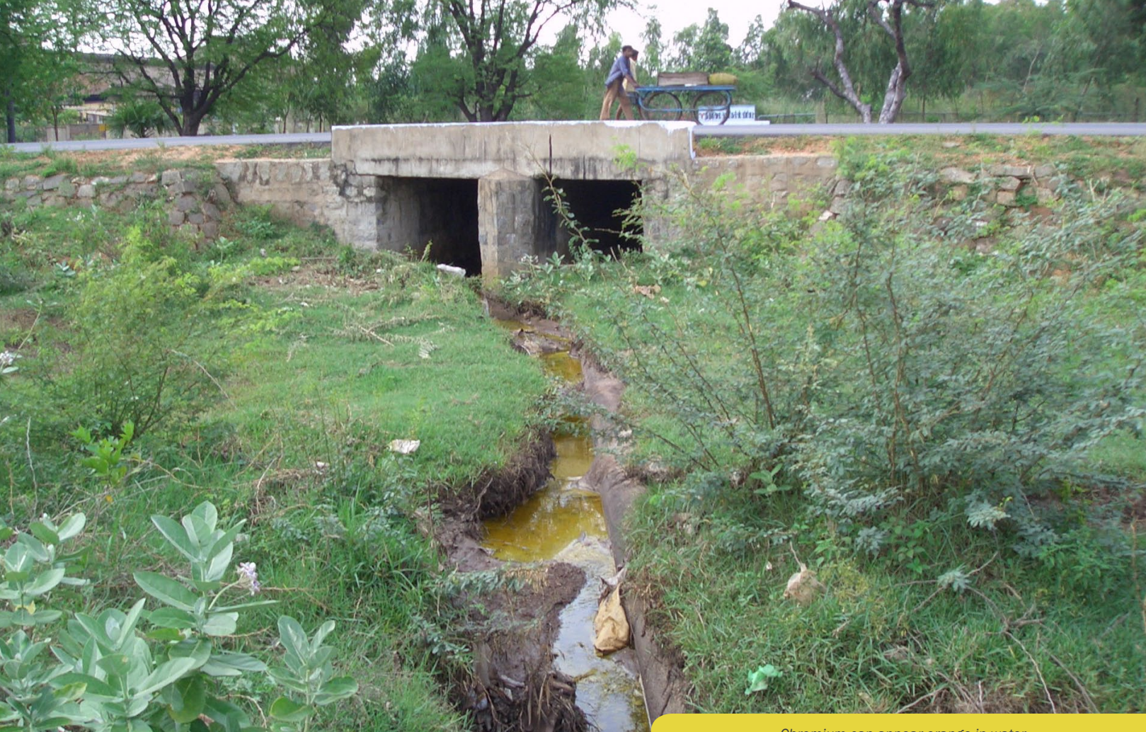
Chromium can appear orange in water