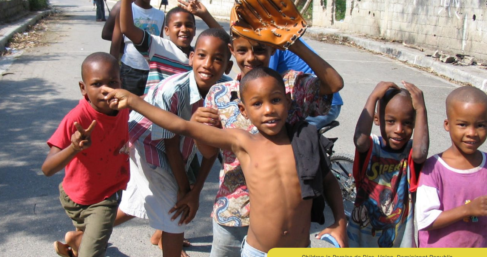
Children in Paraiso de Dios, Haina, Dominican Republic

million USD) were spent on site cleanup work, with funding mainly coming from the municipal government.