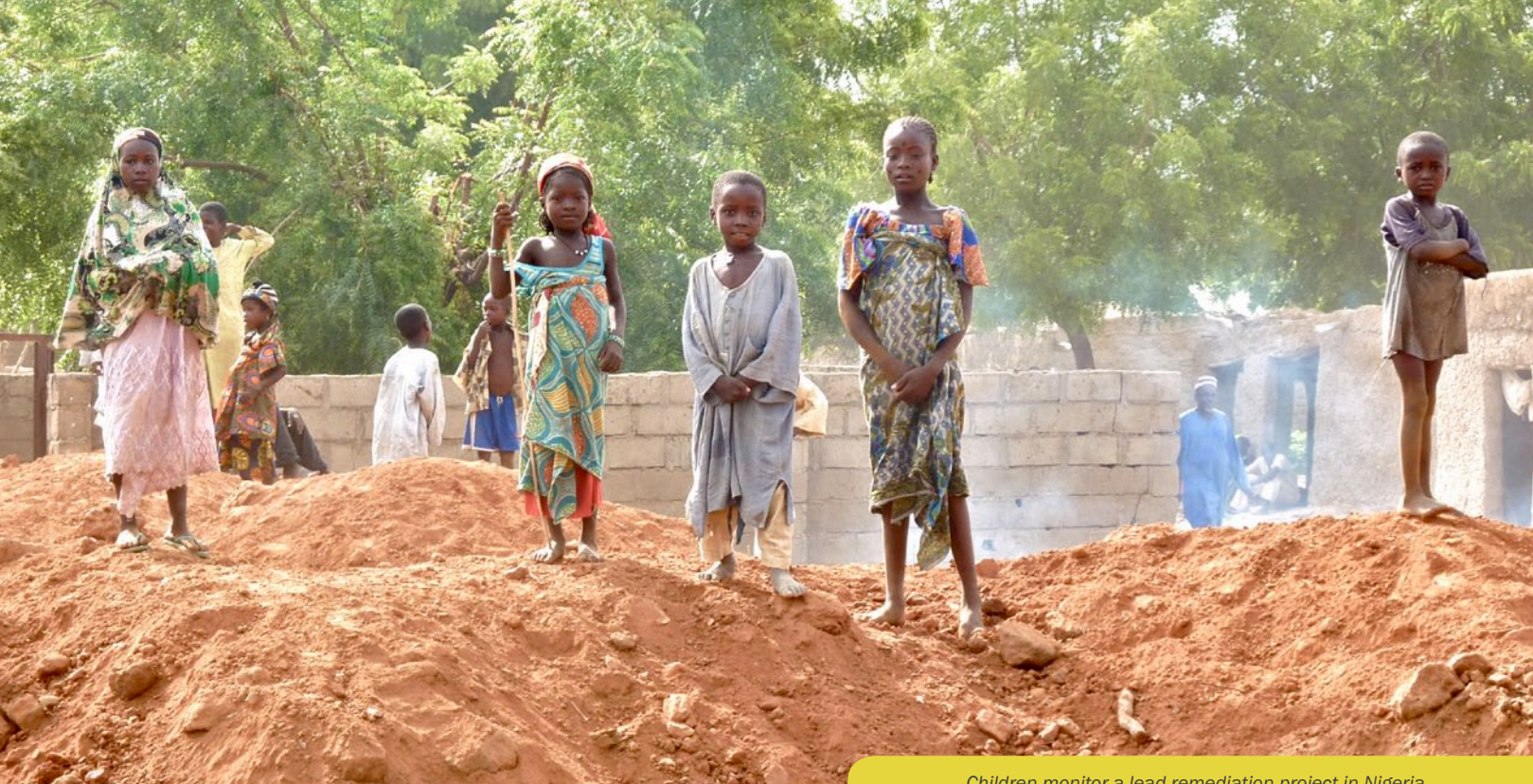
Children monitor a lead remediation project in Nigeria