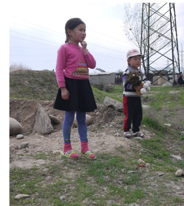
Mailuu-Suu is heavily at risk from radionuclides